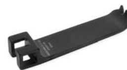
Thin Muscle Blades - 2 Teeth