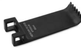
Wide Muscle Blades - 6 Teeth