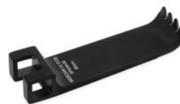
Narrow Muscle Blades - 4 Teeth