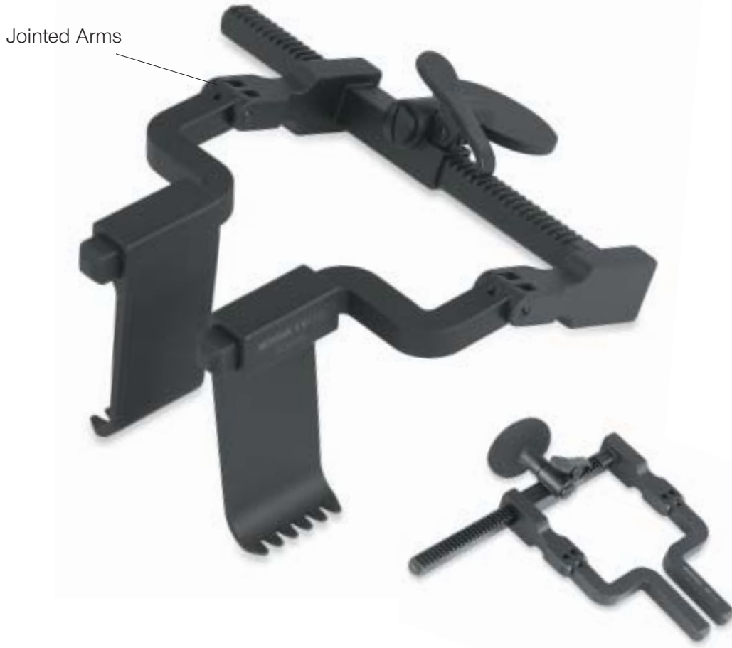
Retractor Frame with Jointed arms