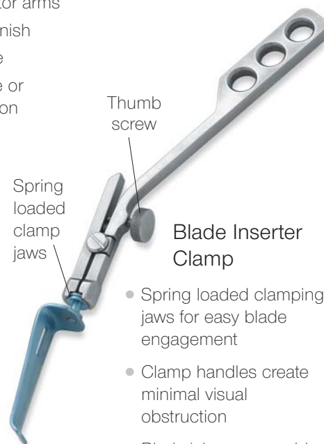
Thumb screw Spring loaded clamp jaws Blade Inserter Clamp