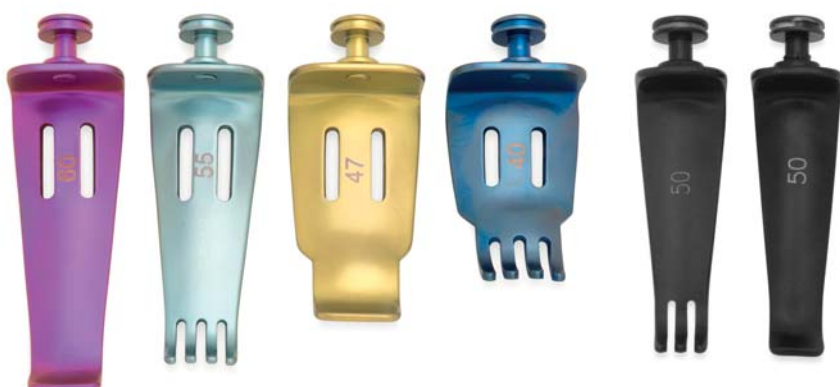
22mm wide blunt blade 22mm wide pronged blade 27mm wide two level blunt blade 27mm wide two level pronged blade 17mm wide optional narrow Cervical blades 40mm to 60mm depth